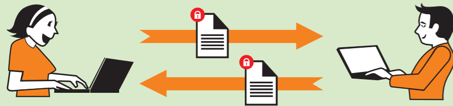
CLOSED FORMAT, IDENTICAL SOFTWARE

Alice uses the software program "Carcera (1) ." She records her report in a closed format (one that does not permit interoperability), then sends it to Bob, who has the same software program. He can read the document, modify it and send it back to Alice.