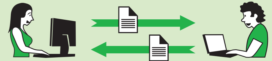
PROGRAMS WITH OPEN FORMATS, DIFFERENT SOFTWARE

So that your documents might be read more easily by other people, without you having to worry about which software they use, choose open formats.