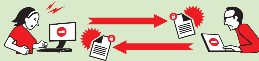
PROGRAMS WITH CLOSED FORMATS, DIFFERENT SOFTWARE

Alice uses the software program "Carcera (1) ." She records her report in a closed format (one that does not permit interoperability), then sends it to Bob, who has the same software program. He can read the document, modify it and send it back to Alice.